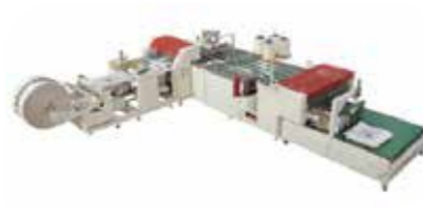
Bag Cutting Stitching