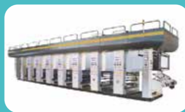
Rotogravure Printing Machine