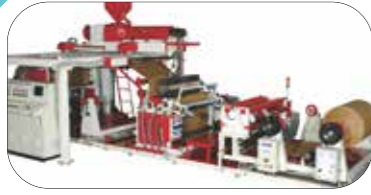
Extrusion Lamination Machine

HDN Packaging is one of India's fastest-growing manufacturers, Supplier & Exporter of HDPE (High-density Polypropylene) & PP (Polypropylene) Laminated woven bag with nearly 8 years of experience in the production of industrial packaging products. Coming over the years, HDN Packaging has set a benchmark in achieving various milestones in a very short span of time.