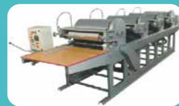
Flexo Printing Machine