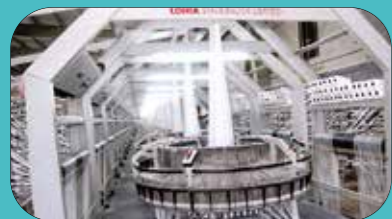
Circular Weaving Machine

The company has set high-quality standards of the products manufactured, very few to be found in India. Started with a production capacity of 10 metric tonnes in the inception year 2009, the company today produces 4000 metric tonnes per annum of high-barrier flexible packaging. company want's to grow as one of t. he leading manufacturers in India.